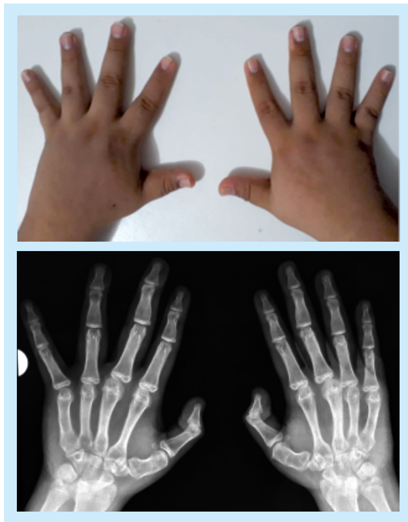
Figure 2. Photograph and radiography of the hands. Marked shortening of the metacarpal bones and distal phalanx of the thumbs

There is an association of PHP with variable resistance to multiple hormones that act through the G \alpha protein. Resistance to TSH is the hormonal alteration that has been most commonly associated and can even be diagnosed before the appearance of phosphocalcium metabolism disorders 16 . In this case, the absence of antithyroid antibodies supports the resistance to TSH diagnosis 11 .